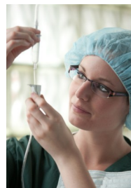
Simple measures stop flu from spreading.

According to a fact sheet provided by the Oklahoma State Department of Health, there are important steps to take to prevent the flu from spreading. Those steps include the following: