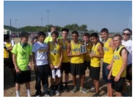
The boys cross country team celebrates a victory.

They will run at OSU in Stillwater next Saturday.